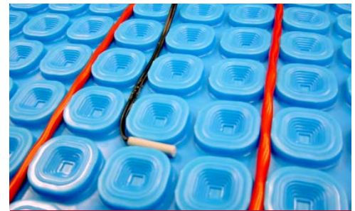
Nuheat Cable's thin cold lead, splice connection and floor sensor are easily embedded in thinset.